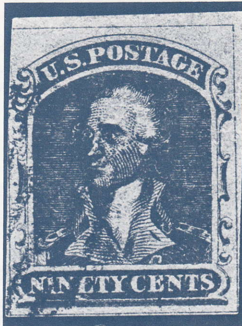
Examples of crude fakes with bogus cancels

Identifying genuine used copies is much more difficult, particularly since many of the used examples show grid cancels that are difficult to authenticate. The collector can apply the following tests that suggest the presence of a counterfeit cancel: