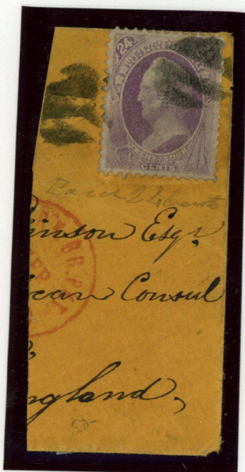
24¢ Purple Stamp removed from piece and counterfeit grill applied. Ex-Caspary