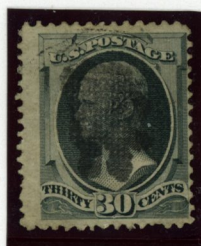
30¢ Black Counterfeit grill points are up instead of down.