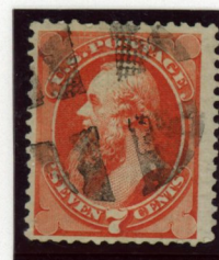
7¢ Vermilion Counterfeit grill applied to stamp with the secret mark (Scott # 160).