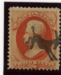
2¢ Vermilion Counterfeit Kicking Mule cancellation. Ink is too black.