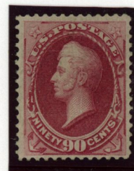
90¢ Carmine Counterfeit grill No actual points, just a series of boxes.