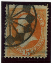
15¢ Deep Orange Counterfeit New York Foreign Mail cancellation. Far too dark and bold.