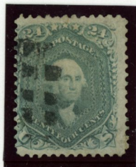
24¢ Red Lilac Chemically altered in an attempt to duplicate the Steel Blue shade.