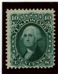
10¢ Green Plate proof on india fraudulently perforated to resemble re-issue.