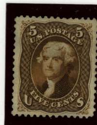
5¢ Brown Plate proof on card fraud- ulently shaved and perfo- rated to resemble re-issue.