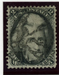
2¢ Black Counterfeit fancy West Meriden, Ct DEVIL AND PITCHFORK cancellation