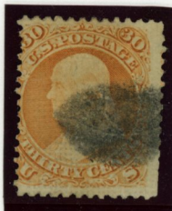
30¢ Orange Counterfeit all over grill with "points up" instead of down.