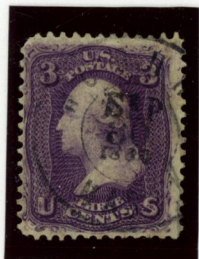
3¢ Violet Perforated Trial Color Essay with fraudulent cancellation.