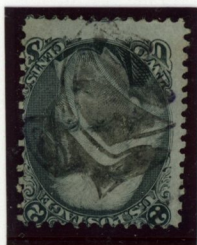
2¢ Black Counterfeit Waterbury, Ct fancy LADY IN A BONNET cancellation.