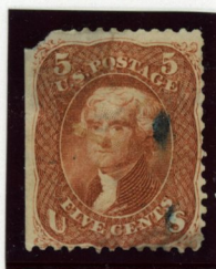
5¢ Red Brown Chemically altered to resemble the "so-called" Fire Red shade.