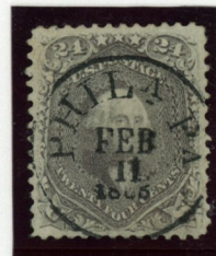
24¢ Gray Lilac Counterfeit "F" Grill Note 1865 year date in cancellation, 3 ½ years prior to the issuance of the stamp.