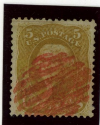
5¢ Buff Completely rebacked adding margins and perforations.