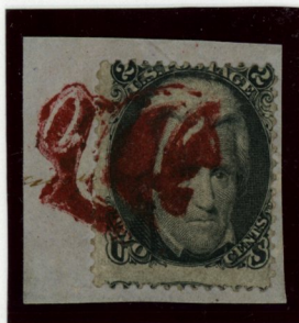
2¢ Black Counterfeit red LADY IN A BONNET fancy cancel- lation in the style of Waterbury, Ct.