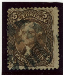
5¢ Brown Counterfeit all over grill with "points up" instead of down.