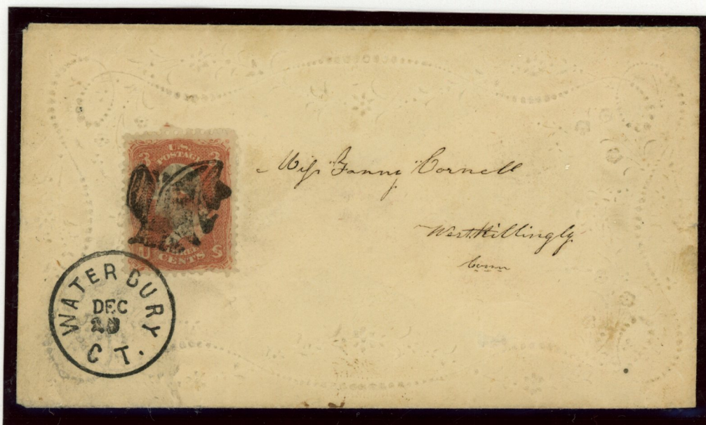
3¢ Rose tied by counterfeit Waterbury, C T postmark and the stamp with a matching counterfeit LADY IN A BONNET fancy cancellation.