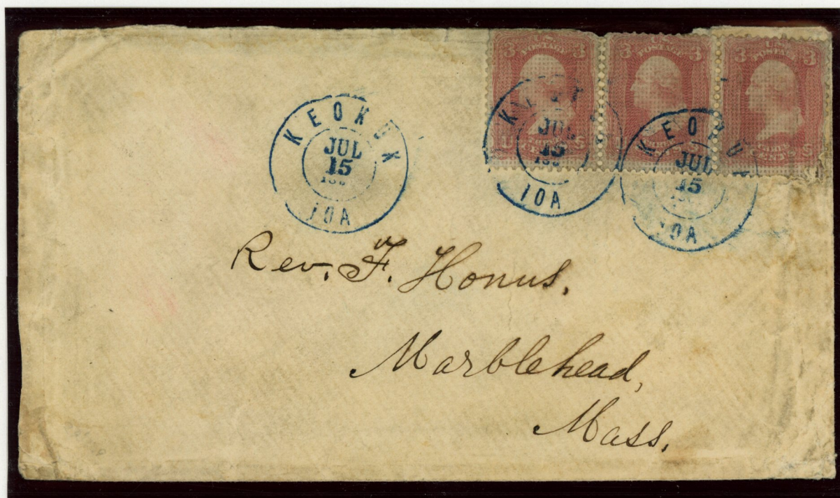
3¢ Rose with all over grill made by pressing a piece of cheese cloth over the stamps. Note that the grill is "points up" and should be "points down". Additionally, the color of these stamps is too rosy for the issued all over grilled stamps.