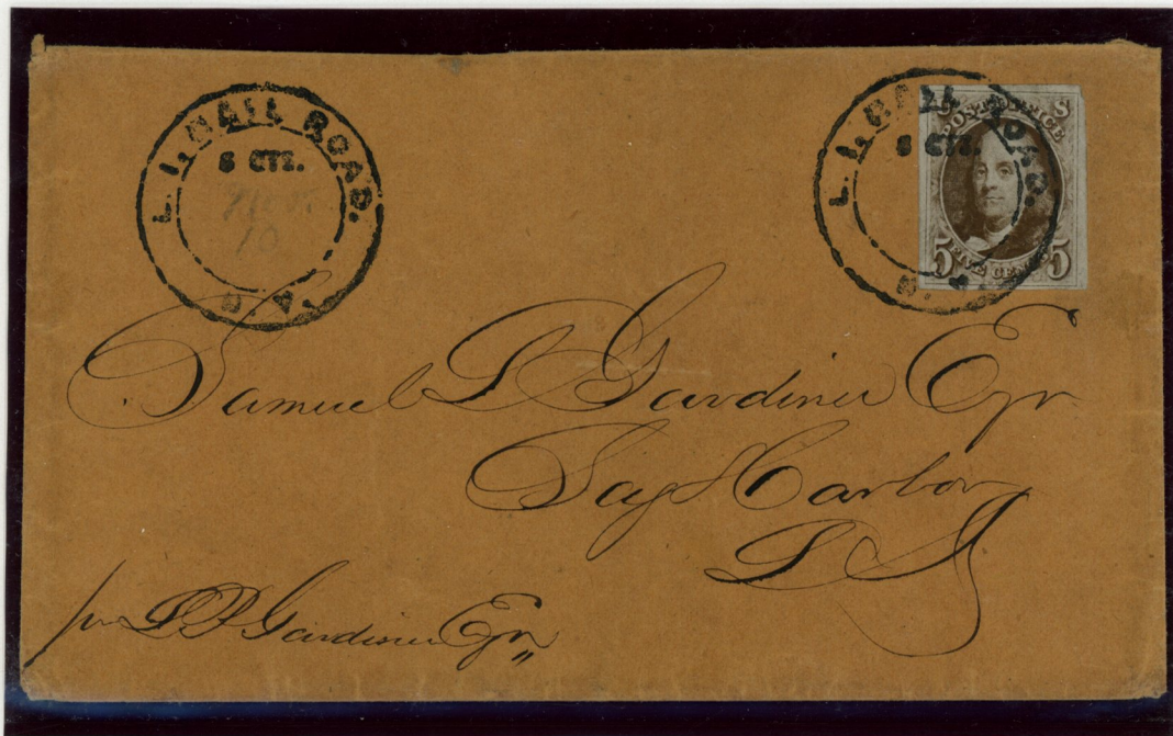
5¢ Brown with pen cancellation removed tied by counterfeit double circle "L. I. Rail Road, N.Y." cancellation. A number of forged covers exist to this addressee.