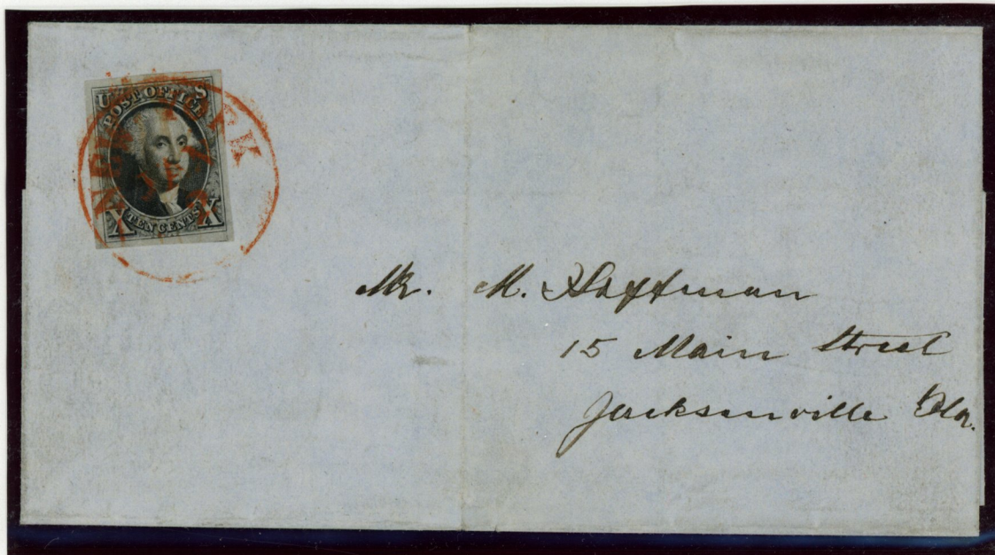
10¢ Black with pen cancellation removed Tied by counterfeit red "New - York Jan 2" postmark on folded cover