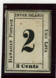
2¢ Black on White Wove No Period After "Cents"