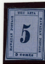
5¢ Blue on Horizontal Laid