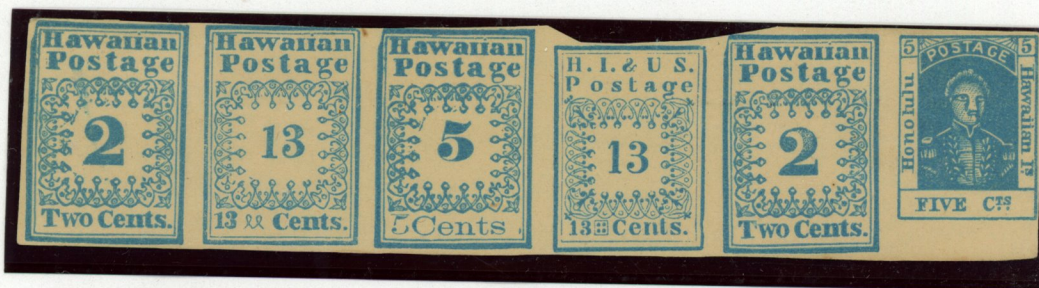
Complete set of Hawaiian Missionaries, plus additional 2¢ and 5¢ Boston Issue Unused, with gum but also exists with red grids and red target cancellations