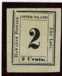
2¢ Black on White Wove Counterfeit made by Jean de Sperati Matches Westerberg's 5 - C - 6 position