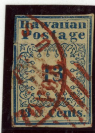
13¢ Blue, Hawaiian Postage Typographed Forgery, Fraudulent cancellation