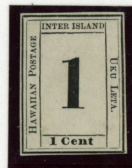
1¢ Black on White Wove No Period after "Cent"