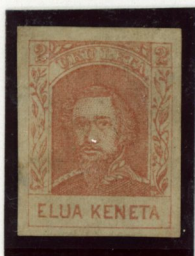
2¢ Pale Rose Counterfeit Stamp On Wove