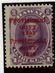
1¢ Purple Counterfeit Double Overprint Color and Letters Wrong