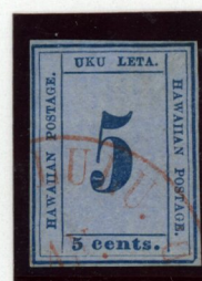
5¢ Blue on Blue Vertical Laid Period After "Cents" Fraudulent Cancellation