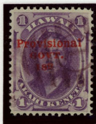
1¢ Purple "189" for "1893" Counterfeit Overprint and Cancellation Note Raised "9"