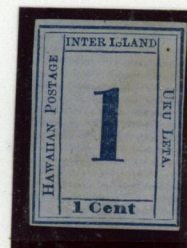
1¢ Blue on Blue Laid No Period after "Cent"