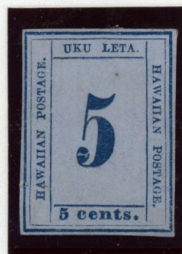
5¢ Blue on Blue Vertical Laid Period After "Cents"