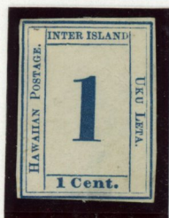
1¢ Blue on White Wove