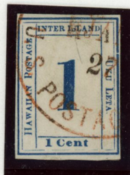
1¢ Blue on White Wove No Period after "Cent" Fraudulent Cancellation