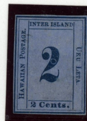
2¢ Blue on Blue Laid