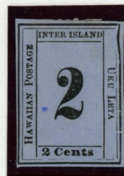
2¢ Black on Blue Horizontal Laid No Period after "Cents"