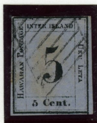
5¢ Black on Gray Wove "Inter Island" at top Fraudulent Cancellation