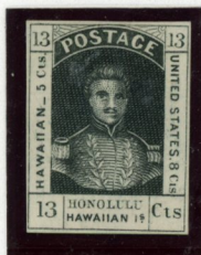
13¢ Black Counterfeit with Tilted "3" at top right