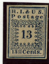
13¢ Blue, H.I. & US. Postage Typographed Forgery, Unused, without gum