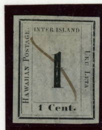
1¢ Black on Grayish Wove Tall Thin Numeral