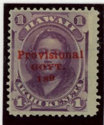
1¢ Purple "189" for "1893" Counterfeit Overprint Note Raised "9"