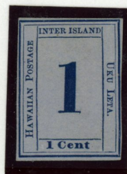
1¢ Blue on Blue Wove No Period after "Cent"