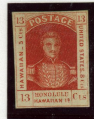
13¢ Dark Red Forgery on Laid Paper Ex - Caspary