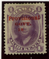
1¢ Purple "18" for "1893" Counterfeit Overprint