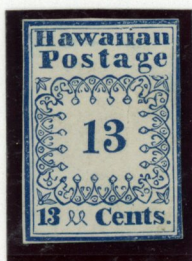
13¢ Blue, Hawaiian Postage Typographed Forgery, Unused, without gum