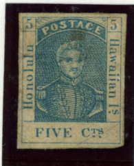
5¢ Blue on Thick Wove Counterfeit Stamp