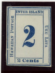
2¢ Blue on White Wove, No Period After "Cents"