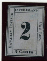
2¢ Black on Blue Wove No Period After "Cents"