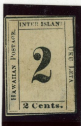
2¢ Black on White Wove Closed Corners