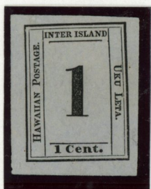
1¢ Black on White Wove Short Top Rule