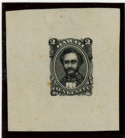
2¢ King Kamehameha IV Lithographed Forgery on India P F C # 195,660