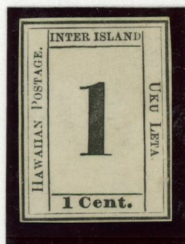
1¢ Black on Laid White Wove Long Rules