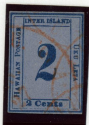
2¢ Blue on Blue Wove, No Period After "Cents" Fraudulent Cancellation