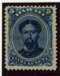
5¢ Deep Indigo Faded Red Counterfeit Overprint