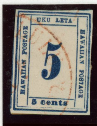
5¢ Blue on White Wove Fraudulent Cancellation