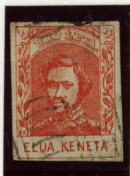
2¢ Pale Rose Counterfeit Stamp and Cancellation on Wove