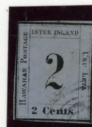
2¢ Black on Blue Vertical Laid No Period after "Cents" Thin Numeral "2"