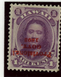
1¢ Purple Counterfeit Inverted Overprint Color and Letters Wrong