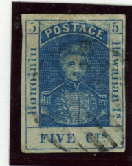
5¢ Blue on Ordinary Wove Counterfeit cancellation Ex - Caspary