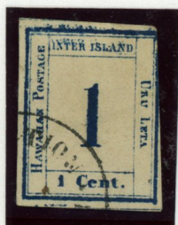
1¢ Blue on White Wove Smeared Print Fraudulent Cancellation