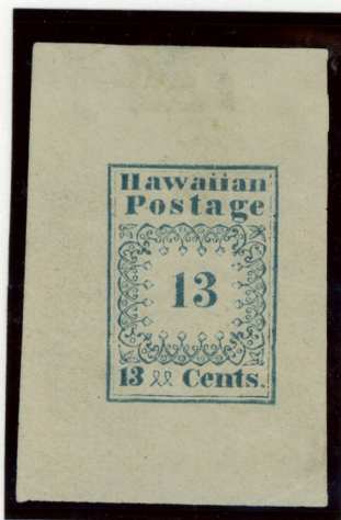
13¢ Blue, Hawaiian Postage Typographed forgery on wove paper, without gum