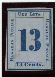
13¢ on Blue Wove Bogus Stamp