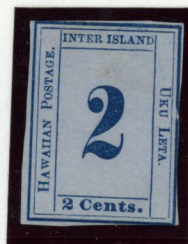
2¢ Blue on Blue Wove