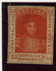
13¢ Dark Red Engraved Forgery Shorter than Genuine Stamp