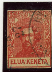
2¢ Pale Rose Counterfeit Stamp and Cancellation on Wove