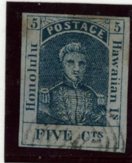
5¢ Blue on Bluish Wove Counterfeit Stamp and cancellation