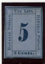
5¢ Blue on Blue Wove "UKU LETA" for "UKU LETA"