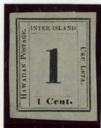
1¢ Black on Grayish Wove Counterfeit made by Jean de Sperati Matches Westerberg's 4-A-5 position