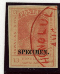
13¢ Dull Rose Hand Drawn Counterfeit Cancellation