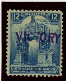
12¢ Bright Blue Counterfeit Handstamped Victory Overprint Color Wrong, P F C # 12,509