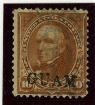
10¢ Brown, Type I Counterfeit Overprint Overprint widely spaced