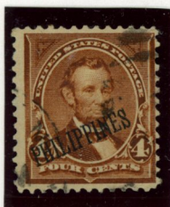
4¢ Orange Brown Counterfeit Overprint Too Short