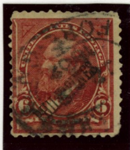
6¢ Lake Counterfeit Overprint Too Short Angle Wrong Letters Too Thin