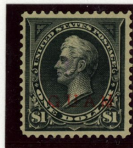
$1 Black, Type I Counterfeit Overprint Courtesy of W T Crowe