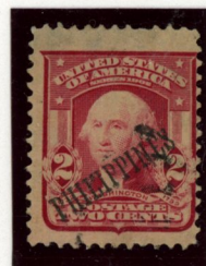
2¢ Carmine Counterfeit Overprint Too Long Angle Wrong