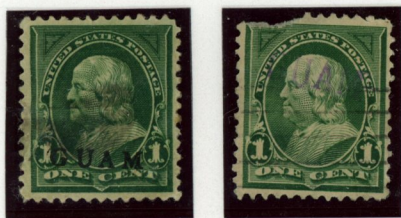
1¢ Deep Green Two different counterfeit overprints. Right stamp with bogus purple overprint.