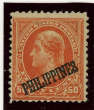
50¢ Orange Counterfeit Overprint Too Long and Too Thick Probably Made by Fournier