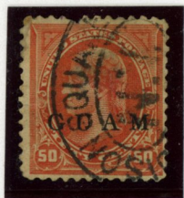
50¢ Orange Counterfeit Overprint NYC postmark