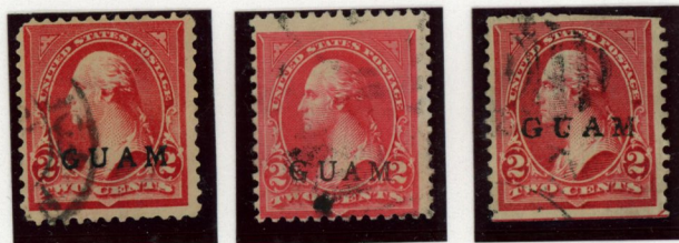
2¢ Carmine, Type III Three different counterfeit overprints Two with Wide Spacing