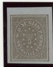
5¢ Counterfeit Double Bar in “A” of Nashville