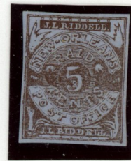
5¢ Counterfeit Fleur-de-lis at bottom left in shape of a hand