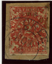
2¢ Red Genuine Stamp Fraudulent Cancel