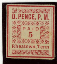
Rheatown, Tenn. 5¢ Counterfeit “Tenn” Incorrect, Should Read “TENN”