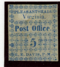
Pleasant Shade, Va. 5¢ Counterfeit Does Not Plate, Center Ornaments Offset, Other Minor Differences