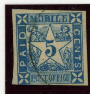
5¢ Counterfeit Made by Upham Four Faces and “5” Incorrect