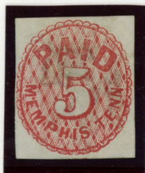
Memphis, Tenn. 5¢ Remainder on Very White Paper, Pale Shade