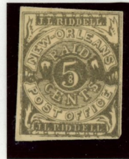
5¢ Counterfeit Numeral “5” and Small “8” Incorrect