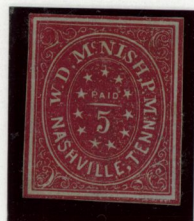
5¢ Counterfeit Double Bar in “A” of Nashville