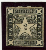
2¢ Counterfeits Each with Incorrect “2”