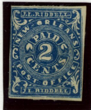
2¢ Blue, Counterfeit “O” and “C” Incorrect