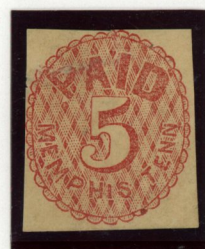
5¢ Counterfeit Missing Two Diamonds Below “5”