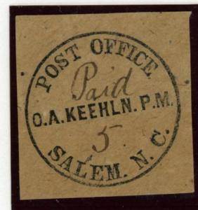
Salem, N. C. Post War Reprint Made From Original Device Letters Too Thick