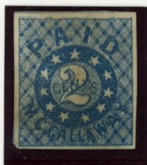
2¢ Counterfeit Tail Incorrect No Diamond inside “D” of “PAID”