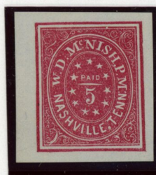
5¢ Counterfeit on Wove Paper Instead of Laid