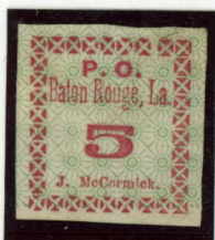
Baton Rouge, La.