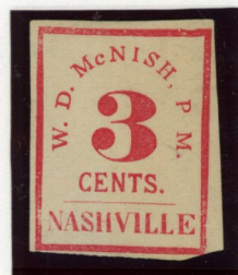
3¢ Counterfeit No Breaks in Framelines