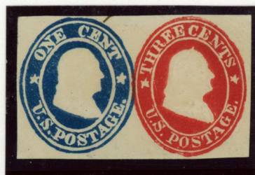
Counterfeit on wove paper 3¢ with head of Franklin instead of Washington.