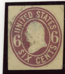
Four Counterfeits on Wove Paper, Each with Fraudulent Cancellation First 6¢ in the wrong color.