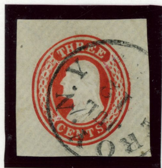
3¢ Red, Die 5, Altered by the addition of White paint to resemble much scarcer Die 3.