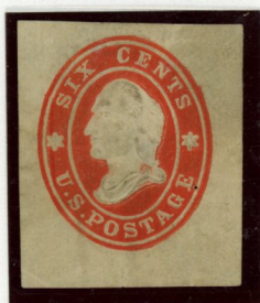
German Counterfeit on wove paper