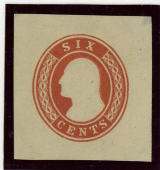
6¢ on Vertically Laid Paper Considered to be a reprint.