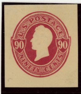
90¢ Carmine on White Dyed to resemble Cream Paper