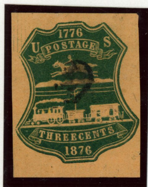
3¢ Green Centennial on Fawn Counterfeit