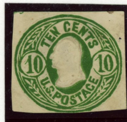
Counterfeit on wove paper