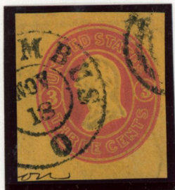
3¢ Pink on White Dyed to resemble Orange Paper variety.