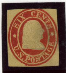
Counterfeit, Head of Franklin instead of Washington.