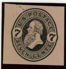
Counterfeit on Pink