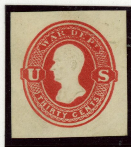
30¢ Carmine on White Dyed to resemble Amber Paper