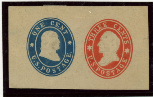
German Counterfeit on wove paper