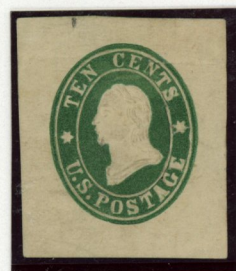
Small Head Counterfeit Bust with beard.