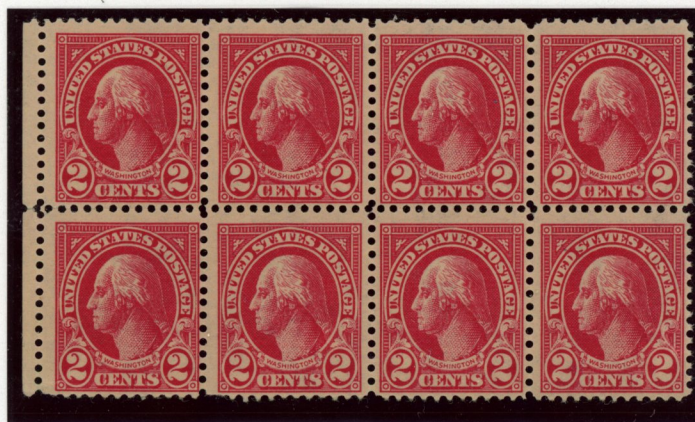
2¢ Carmine, Postal Forgery Sold in 1935 in sheets of 100 at New York City.