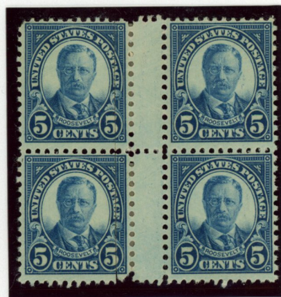
5¢ Blue, Perforated 11x10½ Gutter block made by pasting gutter snipe and additional stamps.