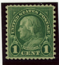
1¢ Green Coil Waste Made from 1¢ horizontal coil, fraudulently perforated 11 at top and bottom.