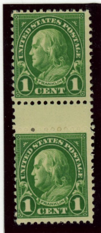
1¢ Green, Perforated 11x10½ Gutter pair made by pasting gutter snipe and additional stamp.